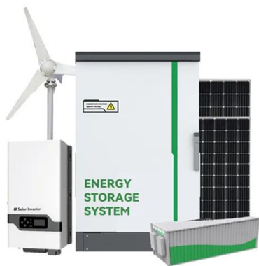
Photo-Rechargeable Electric Energy Storage ...

Solar energy is one of the most promising, effective and emission-free energy sources. However, the energy has to be stored to compensate the fluctuating availability of the sun and the actual energy ...